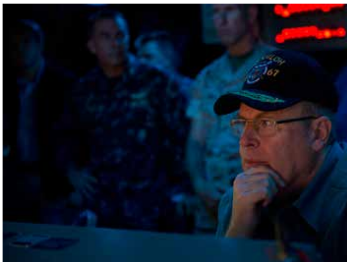
Deputy Secretary of Defense Robert O. Work aboard the USS Shiloh, August 2014.