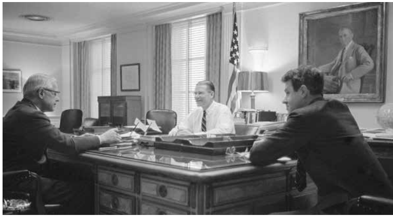
Secretary of the Navy (and future Deputy Secretary of Defense) Paul H. Nitze meets with Secretary of Defense Robert S. McNamara and Deputy Secretary of Defense Cyrus R. Vance, April 1965.

The post of a “second in command” at the Pentagon was not part of the 1947 National Security Act, which created the position of Secretary of Defense.