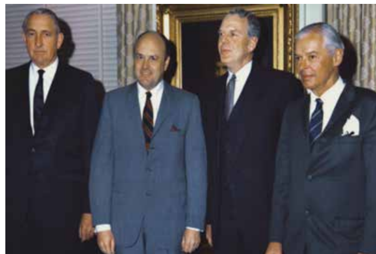
(L-R) Deputy Secretary of Defense-designate David Packard, Secretary of Defense-designate Melvin R. Laird with their predecessors, Secretary of Defense Clark Clifford and Deputy Secretary of Defense Paul H. Nitze, January 1969.

Under the 1949 Amendments, the Deputy Secretary of Defense was appointed from civilian life by the President, with the advice and consent of the Senate, provided the person was not within 10 years after relief from active duty as a commissioned officer of a regular component of the armed forces. The Deputy performs such duties and exercises such powers as the Secretary of Defense may prescribe; acts for, and exercises the powers of, the Secretary of Defense when the Secretary is disabled or absent; and takes precedence in the Department of Defense immediately after the Secretary.