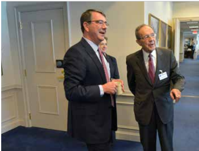
Two former Deputy Secretaries of Defense who later became Secretaries of Defense: Ashton B. Carter (left) and William J. Perry (right), March 2015.