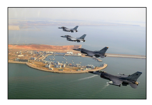
Four F-16 Fighting Falcons fly over the Piung Harbor during a U.S. and Republic of Korea Air Force Coalition flight in celebration of the 60th anniversary of the Korean War.

Asia and Pacific - The Nation's strategic priorities and interests will increasingly emanate from the Asia-Pacific region. The region's share of global wealth is growing, enabling increased military capabilities. This is causing the region's security architecture to change rapidly, creating new challenges and opportunities for our national security and leadership. Though still underpinned by the U.S. bilateral alliance system, Asia's security architecture is becoming a more complex mix of formal and informal multilateral relationships and expanded bilateral security ties among states.