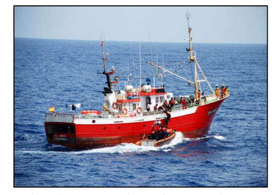
A boarding team made up of crew members from U.S. Coast Guard Cutter Legare (WMEC 912) and representatives of the Cape Verde Coast Guard and Judiciary Police approach a fishing boat during boarding operations in the Atlantic Ocean Sept. 3, 2009.

broader development. To support this, the Joint Force will continue to build partner capacity in Africa, focusing on critical states where the threat of terrorism could pose a threat to our homeland and interests. We will continue to counter violent extremism in the Horn of Africa, particularly Somalia and the Trans-Sahel. We will work in other areas to help reduce the security threat to innocent civilians. We must identify and encourage states and regional organizations that have demonstrated a leadership role to continue to contribute to Africa's security. We will help facilitate the African Union's and the Regional Economic Communities'