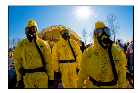
Hazardous material decontamination operators await the arrival of contaminated patients during a simulated nuclear attack during Operation Vibrant Response at Muscatatuck Urban Training Center, Butlerville, Ind., Nov. 8, 2009.

We will counter WMD proliferation as it presents a grave and common threat to our Nation and others. Working through institutions, alliances and coalitions, we will dismantle proliferation networks, interdict movement of materials, further improve nuclear forensics capabilities, and secure nuclear, chemical, and biological materials