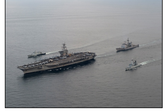
The Nimitz-class aircraft carrier USS Carl Vinson (CVN 70) leads the Royal Malaysian Navy frigate KD Lekir (FF 26) and corvette KD Kelantan (FFL 175) and the Ticonderoga-class guided-missile cruiser USS Bunker Hill (CG 52) during a passing exercise.

freedom of maneuver within the global commons - shared areas of sea, air, and space - and globally connected domains such as cyberspace are being increasingly challenged by both state and non-state actors. Non-state actors such as criminal organizations, traffickers, and terrorist groups find a nexus of interests in exploiting the commons. States are developing anti-access and area-denial capabilities and strategies to constrain U.S. and international freedom of action. These states are rapidly acquiring technologies, such as missiles and autonomous and remotely-piloted