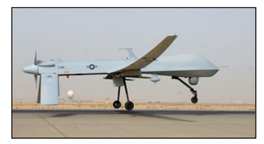
RQ-1 Predators, like the one shown here, are being deployed from Creech Air Force Base, Nev., to provide intelligence, surveillance and reconnaissance capabilities in support of relief efforts in Haiti.

In today's knowledge-based environment, the weight of operational efforts is increasingly prioritized not only by the assignment of forces, but also by the allocation of ISR capabilities. The ability to create precise, desirable effects with a smaller force and a lighter logistical footprint depends on a robust ISR architecture. Across all domains, we will improve sharing, processing, analysis, and dissemination of information to better support decision makers. We will make our