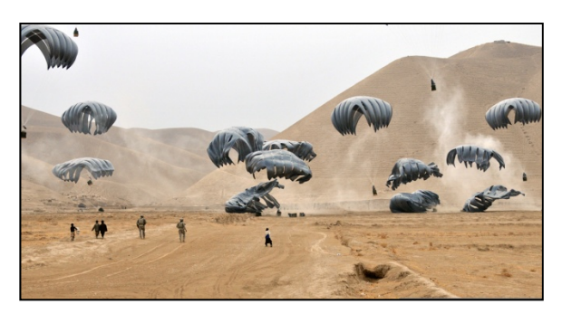
U.S. Service members retrieve cargo dropped from a U.S. Air Force C-17 Globemaster III near Forward Operating Base Todd in Afghanistan's Badghis province on Jan. 6, 2011.

capacity to extend these competitive advantages to others - our unique capabilities amplify their efforts.