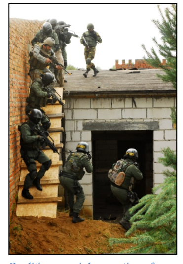
Coalition special operations forces assault a building in search of a mock high-value target in Darwsko, Poland, Sept. 20, 2010, during the opening ceremony for exercise Jackal Stone 2010

Security Sector Assistance - Security assistance encompasses a group of programs through which we provide defense articles and services to international organizations and foreign governments in support of national policies and objectives. To improve the effectiveness of our security assistance, our internal procedures need comprehensive reform. To form better and more effective partnerships, we require more flexible resources, and less cumbersome processes. We seek authorities for a pooled-resources approach to facilitate more complementary efforts