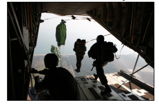
A Royal Thai Marine Corps reconnaissance team conducts jump training with Marines assigned to Force Reconnaissance Company, 3rd Reconnaissance Battalion during exercise Cobra Gold 2011 at U-Tapao Royal Thai Navy Airfield, Chanthaburi province, Thailand, Jan. 21, 2011.

security cooperation, exchanges, and exercises with the Philippines, Thailand, Vietnam, Malaysia, Pakistan, Indonesia, Singapore, and other states in Oceania - working with them to address domestic and common foreign threats to their nation's integrity and security. This