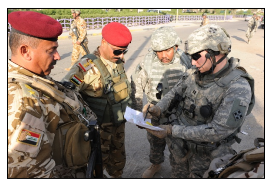
U.S. Soldiers assigned to 3rd Platoon, Charlie Company, 1st Battalion, 68th Armored Regiment, 3rd Brigade Combat Team, 4th Infantry Division provide support to the 2nd Battalion, 50th Brigade, 14th Iraqi Army Division in a cordon and search outside Joint Security Station Basra Operations Command, Iraq, July 25, 2010.

Broader Middle East - Our Nation has important interests in the greater Middle East. The most significant threat to regional stability remains an Iranian regime that continues to seek the development of nuclear weapons, as well as continuing to provide support to terrorist organizations throughout the broader Middle East. To support and advance our Nation's interests, the Joint Force will pursue security cooperation and help strengthen the defense capabilities of our allies and regional partners. We will support efforts to