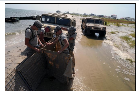
Soldiers of the Alabama National Guard build and maintain miles of HESCO barriers to protect Dauphin Island, Ala., beaches from the BP oil spill, July 23, 2010.

Working with Canada and Mexico, we will remain prepared to deter and defeat direct threats to our North American homeland.