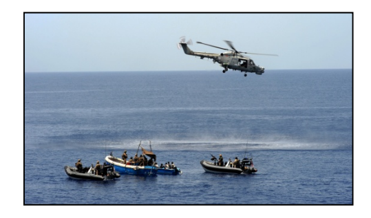
While conducting counterpiracy operations in the Gulf of Aden as part of Combined Maritime Forces (CMF) Task Force 151, the Royal Navy Type 23 Frigate HMS Portland (F 79) detected, intercepted and boarded two suspicious skiffs preventing a possible pirate attack.

Transnational Challenges – In combination with U.S. diplomatic and development efforts, we will leverage our convening power to foster regional and international cooperation in addressing transnational security challenges. Response to natural disasters and transnational threats such as trafficking, piracy, proliferation of WMD, terrorism, cyber-aggression, and pandemics are often best addressed through cooperative security approaches that create mutually beneficial outcomes. Working to address these threats provides a rough but adaptable agenda